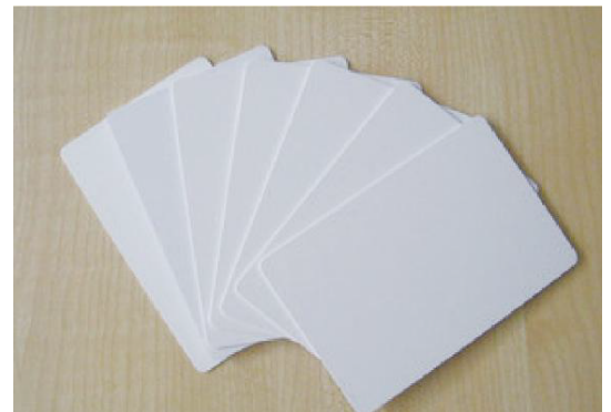
实物图 (Product Image)